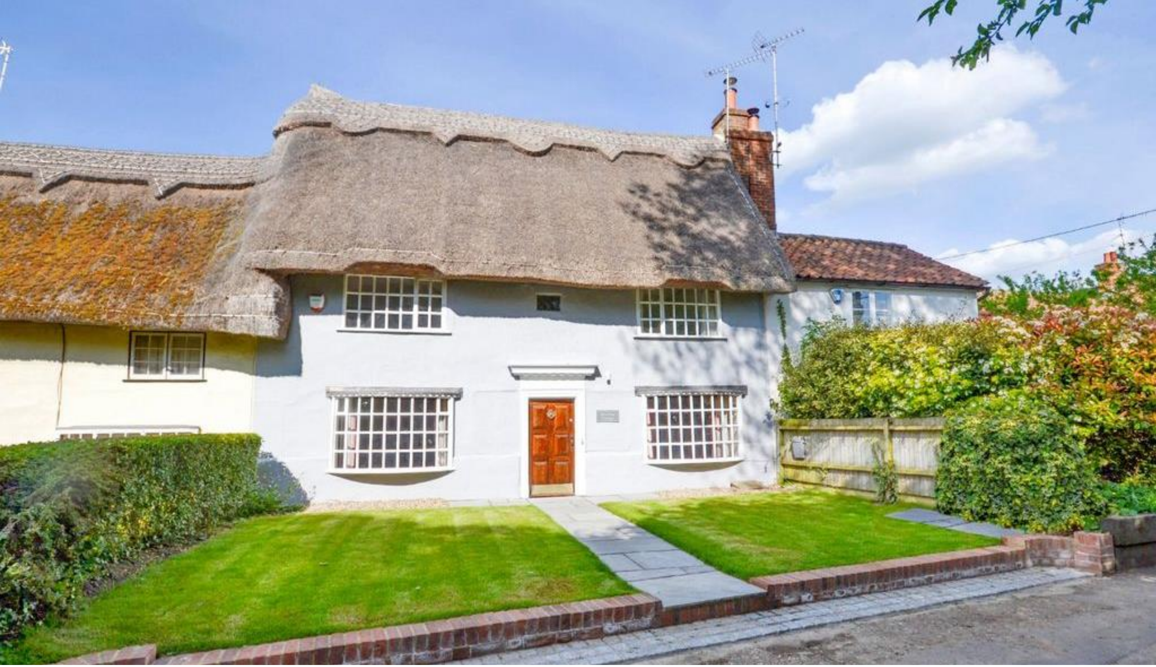
Yew Tree Cottage, The Druce CB11 4QP